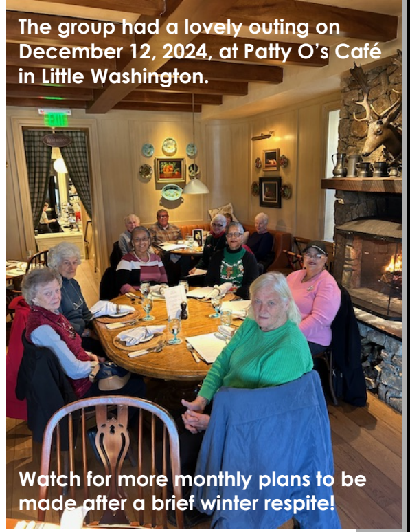
Watch for more monthly plans to be made after a brief winter respite!

The group had a lovely outing on December 12, 2024, at Patty O's Café in Little Washington.