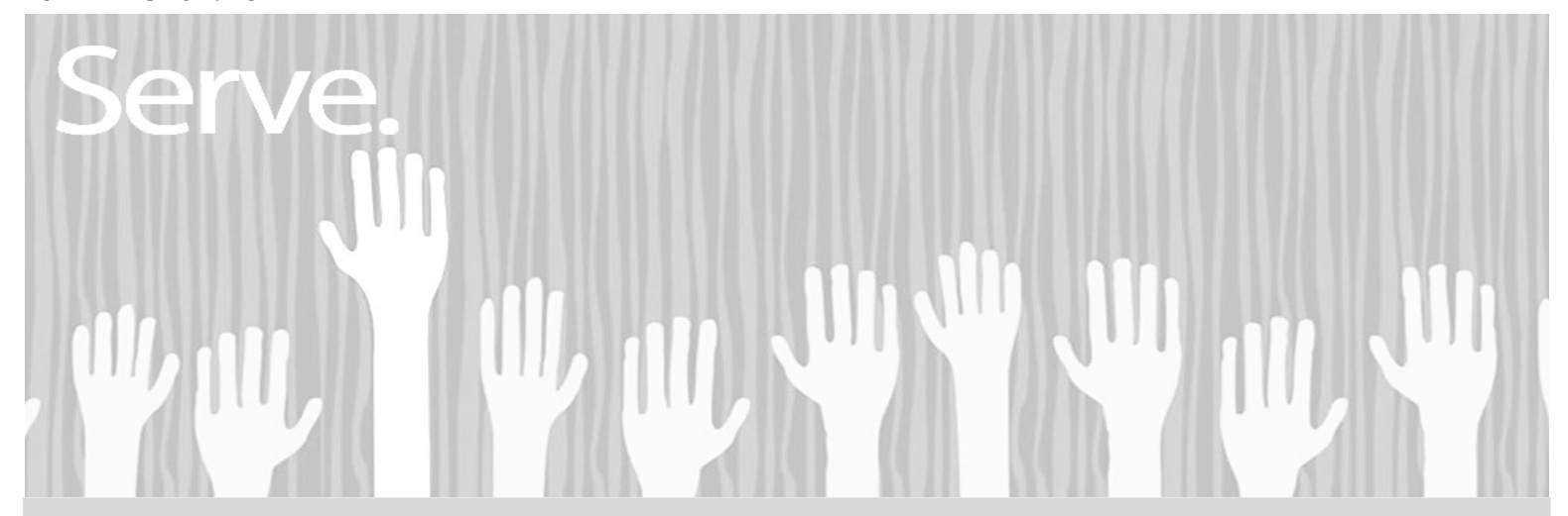
Copyright © 2021 Marshall UMC. All rights reserved.